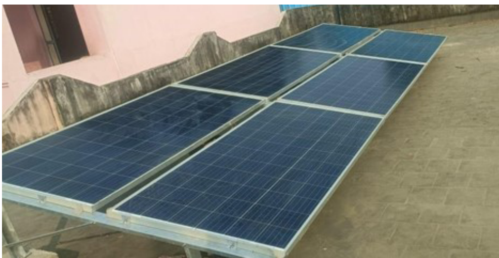
The water filtration system is powered by solar panels, preventing the school from incurring additional electricity costs.

The new filtration system has fortified the school and its surrounding community against the impacts of natural disasters by providing a dependable water source during emergencies. Access to clean drinking water will directly contribute to the health and well-being of students and residents, reducing the risk of waterborne diseases.