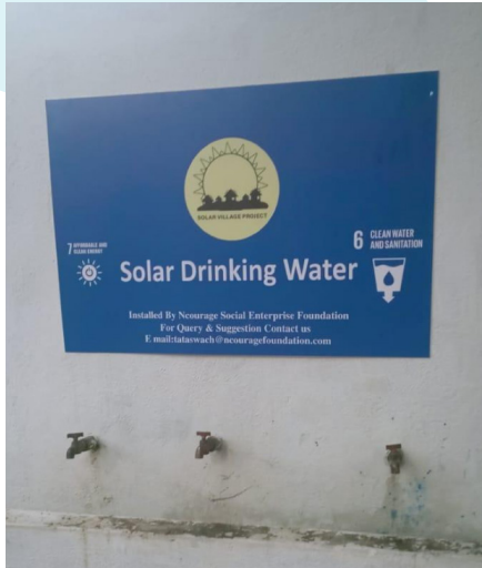
Solar drinking water taps.

BBF has partnered with Solar Village Project to bring sustainable energy solutions to communities in need for many years. This year, BBF funded two solar projects in India to improve access to clean water and reliable electricity.