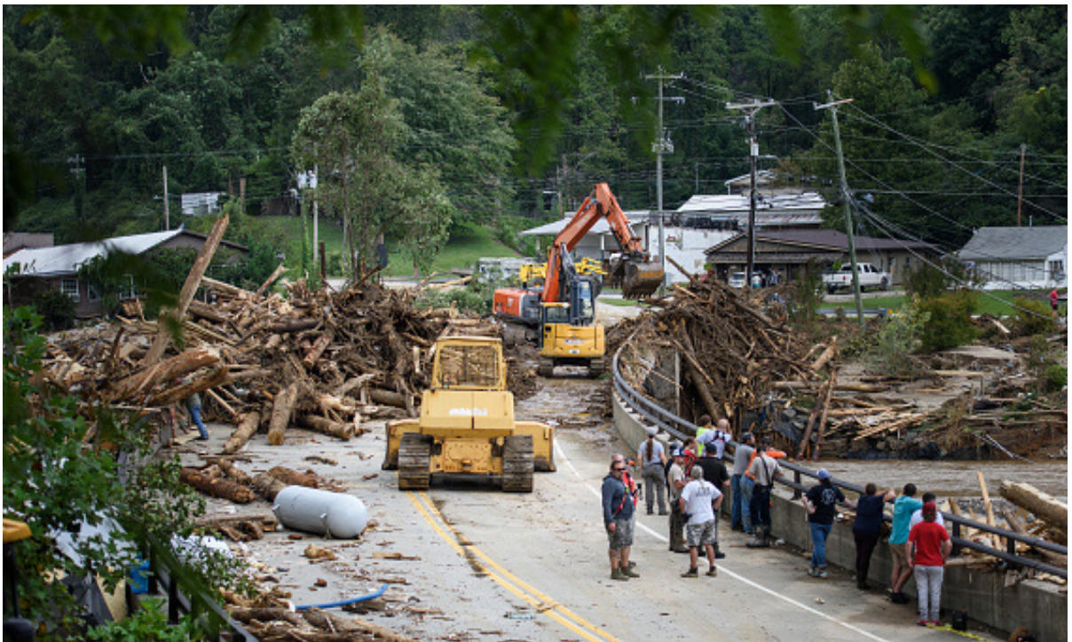
Lake Lure, North Carolina. September 28, 2024. Heavy machinery clears a road after heavy rains caused by Hurricane Helene.

In the first three quarters of 2024, BBF provided grants, medication, healthcare equipment, and humanitarian supplies for relief and recovery efforts in the USA, India, Nepal, and Ukraine. These disasters included Hurricanes Helene and Milton in the USA, Cyclone Michaung in India, and landslides in Nepal.