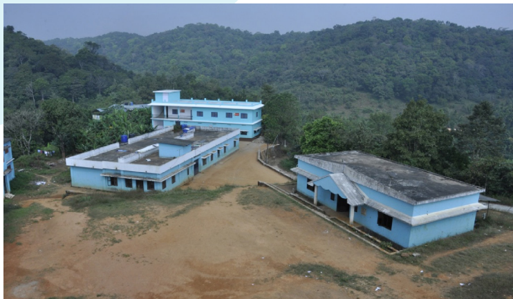
Vivekananda Tribal Residential School in the Wayanad district, Kerala.

location and poor connection to the electric grid results in frequent power outages, leaving students and staff without electricity and other crucial services. The solar project will provide access to continuous power in the main school building as well as the boys' and girls' hostels.